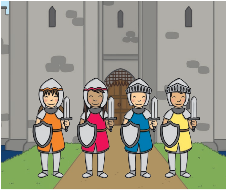
Knights and Dragons