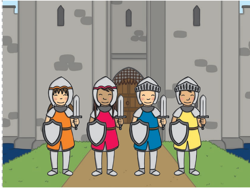
A 'Let's Write Together!' Book